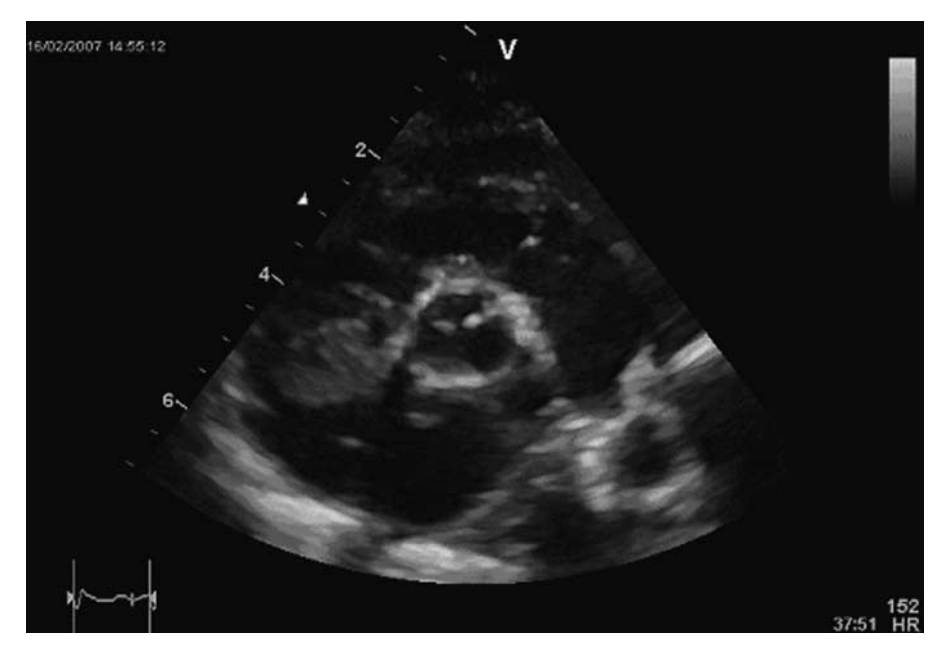
Figure 1. The transthoracic short-axis view shows an inhomogenous echogenic mass adherent to the right atrial wall 8 weeks after surgical closure of ventricular and atrial septal defects.