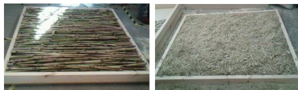
Figure 5.- Quila perpendicular to heat flow. Figure 6.- Quila chipped with garden shredder. Test panels before closing.

In order to comply with the Chilean standard which states that samples should be reasonably presented with flat, parallel faces five sample panels were constructed, 4 with a softwood frame 1375mm x 1555mm x 90mm faced with 9mm MDF leaving a space of 1293mm x 1473mm x 90mm. this space was then filled with the selected insulations (figs. 3-7). The fifth panel consisted of two 9mm MDF boards nailed together to allow the deduction of their conductivity in the calculation of the coefficient of the insulation materials. The densities were those achieved via manual compaction.