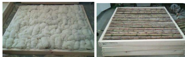
Figure 3.- Sheep's wool washed and carded. Test panel before closing with second MDF panel. Figure 4.- Colihue perpendicular to heat flow

The materials selected to be tested were. Sheep's wool washed and carded (fig.3), colihue laid perpendicular to heat flow (fig. 4), quila laid perpendicular to heat flow (fig. 5) and quila chipped with a mobile garden shredder (fig. 6). Chipped colihue was not tested due to the hardness of the material.