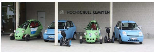
Figure 1: Some of the electric vehicles used in the eE-Tour Allgäu electromobility project.

Introduction. Electric vehicles (EV) powered by batteries will likely play a significant role in the road traffic of the future: they can be powered by regenerative energy sources such as wind and solar power, and they can recover some of their kinetic and/or potential energy during deceleration phases. However, the unique characteristics of EVs – limited cruising range, long recharge times, and the ability to regain energy during deceleration – have an impact on algorithms used in navigation systems and route planners, since it now becomes more important to determine the most economical route rather than just the fastest or shortest one. This modification might appear insignificant at first glance, as it seems enough to simply exchange time and distance values with energy consumption in the underlying routing problem. But on a second glance, several new challenges surface, which require novel algorithms that go beyond existing solutions for route search in street networks. In our work within the German electromobility model project eE-Tour Allgäu (see Fig. 1), we developed extensions to general shortest-path algorithms that address the problem of energy-optimal routing for EVs.