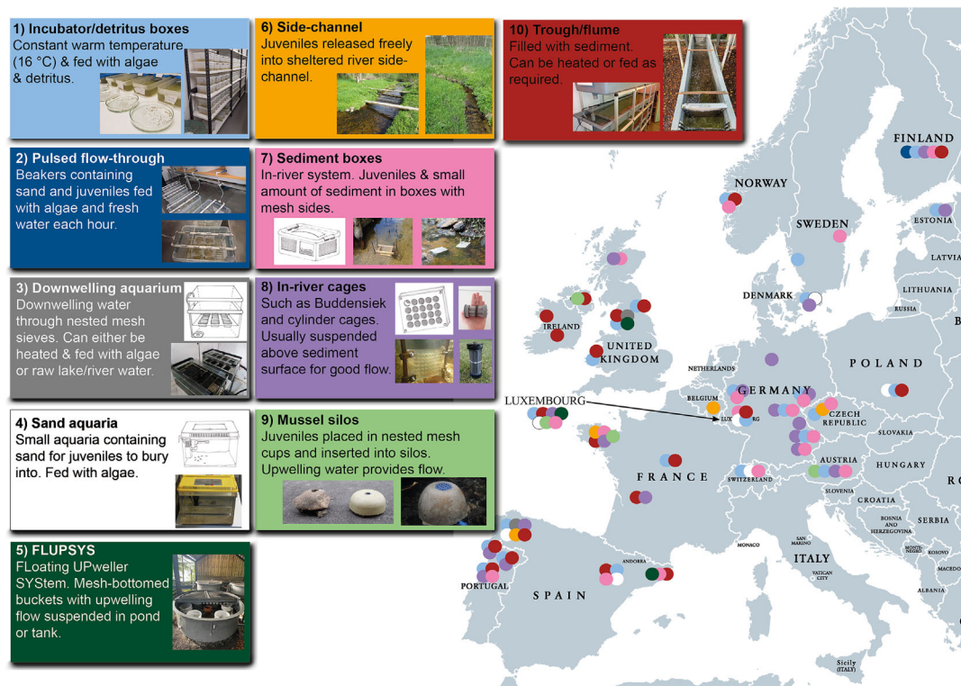
FIGURE 1 Captive breeding methods used for freshwater mussels throughout Europe. Coloured dots on the map refer to the different techniques described in the note boxes. Boxes 1 and 2 describe high-intensity methods, requiring maintenance at least once per week; boxes 3–5 describe medium-intensity methods, requiring maintenance at least once per fortnight; and boxes 6–10 describe low-intensity methods, requiring maintenance approximately monthly, or as needed

Floating Upweller System (FLUPSYS) (Patterson et al., 2018) all require medium to high levels of attention. The most resource-intensive systems per juvenile reared are the incubator/box and the pulsed flow-through systems (Kunz et al., 2020; Hyvärinen et al., 2021). In the incubator system, juveniles are kept in static water in boxes (with usually 200–500 individuals per box) and are cleaned and supplied with fresh water, food, and detritus one or two times per week. The pulsed flow-through system provides water (and food) changes at regular intervals (as much as once per hour), but there are usually no more than 50–100 juveniles per beaker. The lower resource-intensive systems are the downwelling aquarium system (with 1000 juveniles per sieve, and containing 12–15 sieves, cleaned every 2 weeks), the sand aquaria (with 150–500 juveniles per system, and a weekly water exchange), FLUPSYS (with several hundred to 1000 juveniles per bucket, and cleaned when necessary), and flumes (with several thousand individuals per flume, and cleaned when necessary).