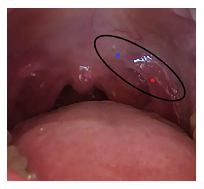
Fig. 2. Injection site of botulinum toxin (7.5 units) injected (red dot) just medial to the pterygoid hamulus (inside black ellipse) and 3 units of botulinum toxin injected just lateral to the musculus uvula (blue dot). [Color figure can be viewed in the online issue, which is available at www.laryngoscope.com.]

contractions, and OT coincided temporally. We changed the diagnosis to PM and took botulinum toxin (Botox, Allergan) injection in the area of the lateral soft palate (Fig 2). It was done in narcosis because he did not take it well in local anesthesia. There occurred slight difficulties with swallowing developed after the injection but resolved completely after one week. His symptoms diminished in the next few days, until the writing of this text, the patient has been free of symptoms for three months. However recently he mentioned the noise was back at a low volume but it would not affect his life.