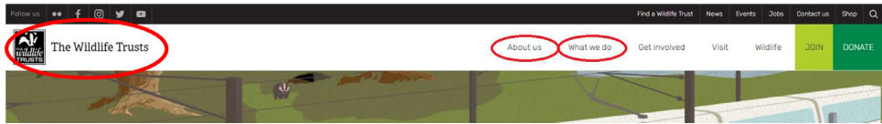
Fig. 1. Screenshot example of homepage.