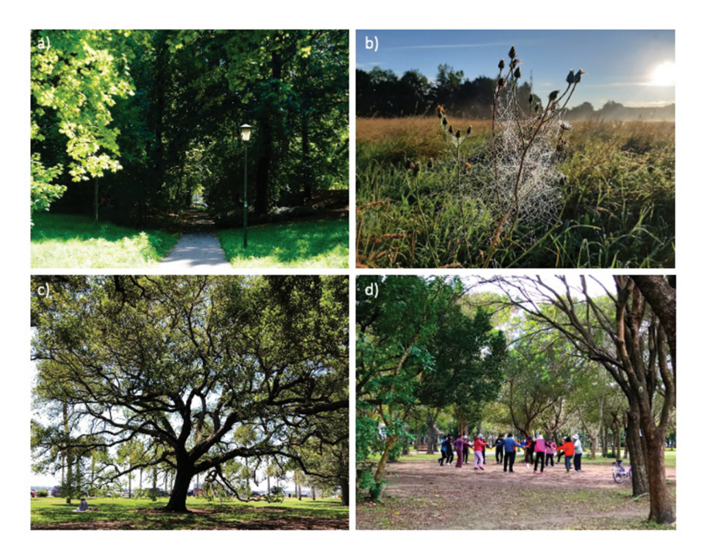
Figure 1. Urban green spaces are important for: climate change mitigation through shading and vegetation structural complexity (a: Hans-Fischer-Straße Park in Munich, Germany); biodiversity of plants and animals, arthropods and birds (b: spider web in field in Taxispark in Munich, Germany); and human health and wellbeing through stress release and restoration (c: woman sitting under the shade of a tree in Charleston, USA), and through and recreation and socializing (d: group meeting for Tai Chi exercises in a park in Taipei, Taiwan).