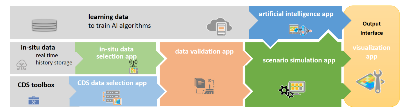
Figure 2. Schematic representation of the intended design of intuitively usable, modular apps (basic function modules). CoKLIMAx flexibly combines data and evaluation tasks in a module-like manner (based on the basic functionalities and scope of services of the AMCDS toolbox).

We implement the application functions of the AMCDS toolbox in the form of apps, which are modularly combined through standardized interfaces. The apps cover one or a few functional steps of data localization, combination, processing, and presentation of results. We will integrate this modular function structure into the apps for self-description and ensure that only combinations that make sense can be applied, following the poka-yoke (Japanese for "mistake proving") principle. Furthermore, the user can only put together such modular content (in each case, local checks at the corresponding combination point of function modules), resulting in technically low-threshold applicability. The above approach will ensure simple handling, assuring the data and workflows are consistent with the organizational requirements (Figure 2). As such, the module/app design is also inherently aligned with the public sector's relevant work and administrative processes.