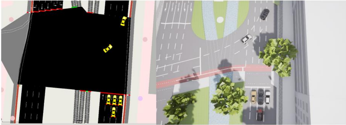
Figure 2 Interfacing an ongoing SUMO simulation (left) into a 3D VR environment in Unity (right).