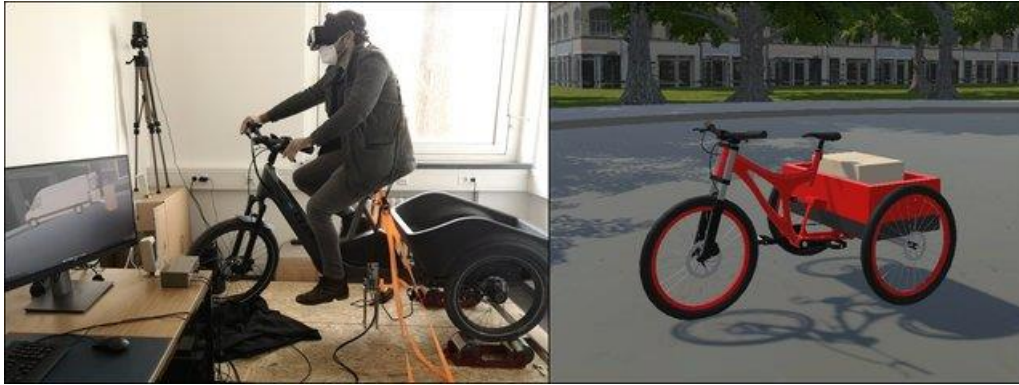
Figure 4 Depiction of a test subject operating the electric cargo bicycle simulator with typical sensor setup and usage of a Varjo XR-3 (left) and of the virtual electric cargo bicycle in VR environment in Unity (right).