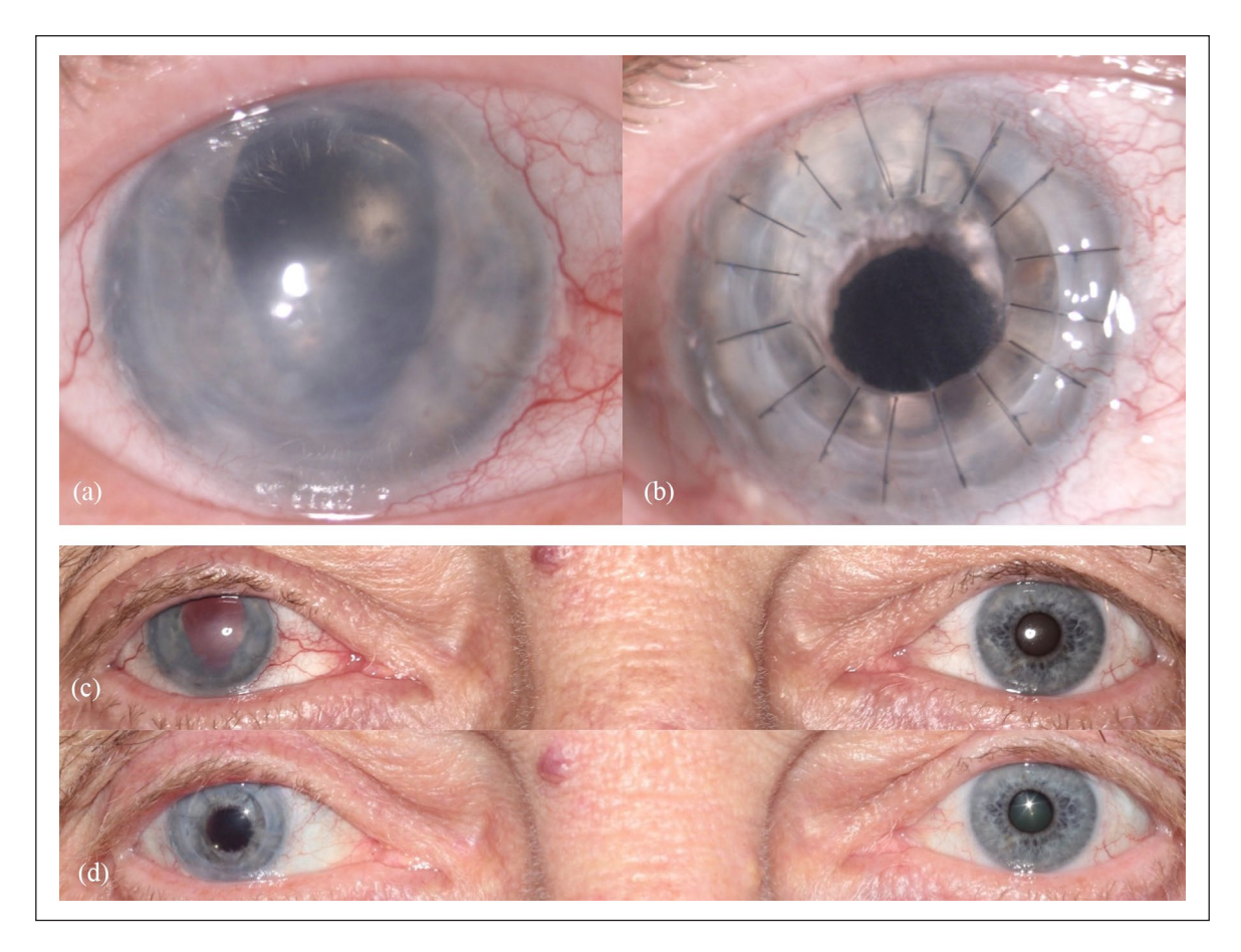
Figure 2. Findings in patient 1: (a) preoperative close-up photograph of the traumatized right eye, (b) postoperative close-up photo after combined surgery (perforating keratoplasty and implantation of an artificial iris and IOL), (c) preoperative binocular photograph, and (d) postoperative binocular photograph.

Figure 2(a) and (c) and Figure 3 (left column) show the preoperative findings of all patients.