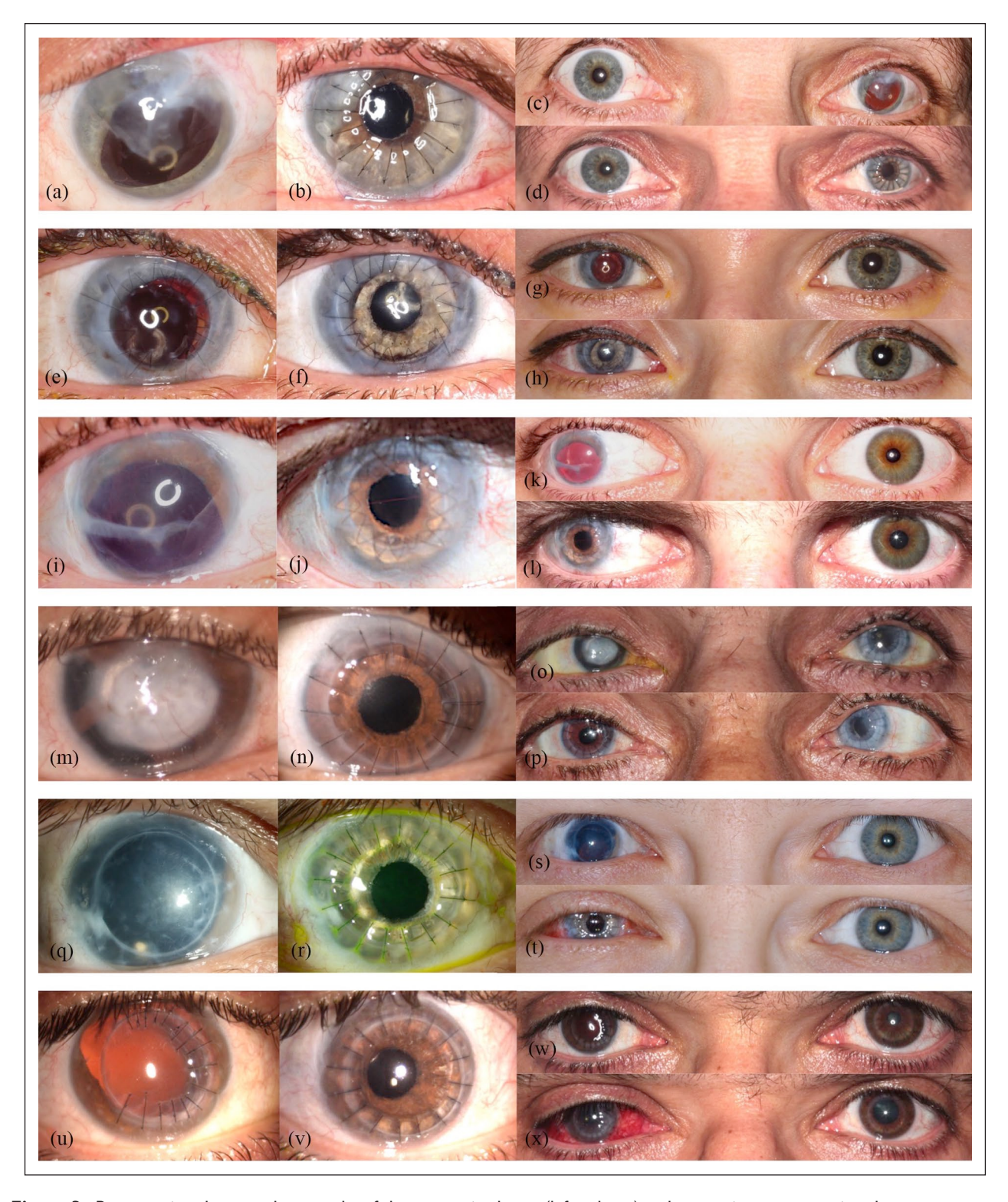
Figure 3. Preoperative close-up photographs of the traumatized eyes (left column) and respective postoperative close-up photographs of the same eyes (middle column) in the remaining six patients. Preoperative binocular photographs (upper sections of the right column) and postoperative binocular photographs (lower sections of the right column) ((a)-(x)).

as a satisfying cosmetic result. Yoeruek et al.<sup>5</sup> treated five patients with combined AI + IOL implantation and kerato-plasty. They observed an increase in BCDVA, reduction of