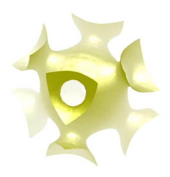
Figure 2. Isosurface plot of the reconstructed 3D \rho^{2\gamma} of copper from only three projections. The density for the isosurface is chosen in such a way, that the resulting isosurface divides the Brillouin zone in two equal parts.

zone in equal parts is plotted, which has the well known shape of the Fermi surface of copper (see e.g. [10, 11]). Although the qualitative agreement with previous measurements is good, three projections are not sufficient to extract reliable quantitative data.