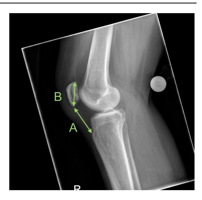
Fig. 1 Lateral view (X-ray) of the knee showing the assessment of the Insall–Salvati Ratio (ISR, A/B)

Patella height was measured using the Insall–Salvati (IS) score on X-rays in lateral view. The Insall–Salvati Ratio (ISR) was assessed by measuring the distance from the tibial tuberosity to the inferior pole of the patella as well as by measuring the longest diameter of the patella (see Fig. 1). The ISR was assessed on X-rays of all enrolled patients primarily 2 days after surgery (group A) and secondarily