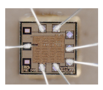
Figure 1. Photograph of the CUBE ASIC.

low-noise charge sensitive amplifier that has been developed in CMOS technology. Without being connected to a detector, the ASIC has a superior noise performance of 35.5 e^- (ENC) [3]. Fig. 1 shows a photograph of the chip. It is functional at cryogenic temperatures down to 50 K and has a maximum power consumption of about 60 mW. The internal feedback capacitance of C_{\rm f} = 500 \text{ fF} \pm 10\% translates into a large dynamic range corresponding to energies larger than 10 MeV in germanium at cryogenic temperatures. The ASIC requires three supply voltages. Each of these supplies needs at least one bypass capacitor for the correct suppression of the voltage supply noise.