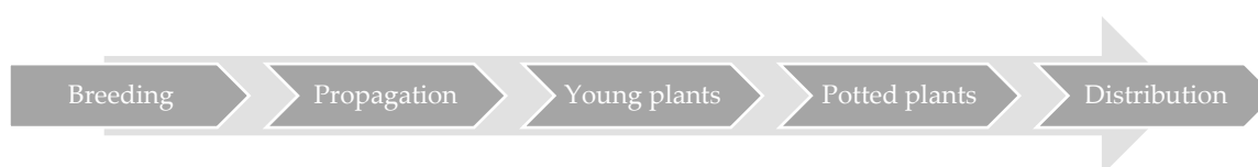
Figure 1. Value chain stages of flowering potted plants.

In recent years, there has been a growing criticism on the environmental and social burdens associated with ornamental plant production [4,5]. However, so far sustainability challenges in the value chain of flowering potted plants have not been defined. Investigation on social and environmental sustainability impacts in floricultural value chains focused on the production of cut roses in Africa and Latin America [6–8]. Sustainability assessment of potted plant focused mainly on environmental aspects such as carbon footprint [9]. Furthermore, only production stages taking place in Europe or in the USA, such as young plants and potted plants were assessed in prior studies (Figure 1). Other value chain stages such as breeding and propagation were not considered for the assessment.