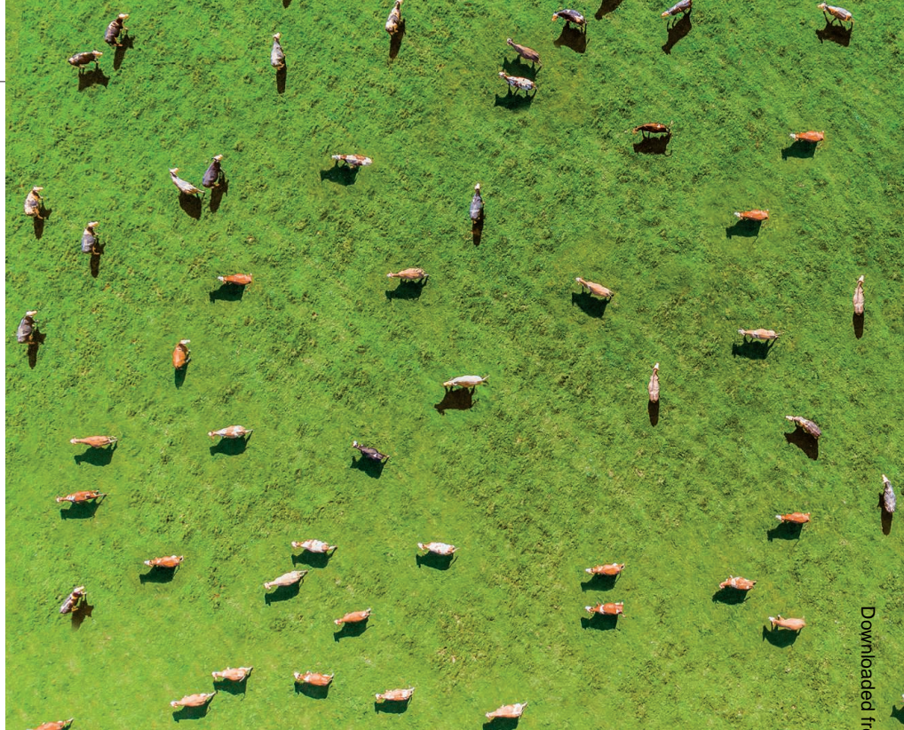
Expanding agricultural land and livestock production could conflict with forest restoration goals.

1 Kiel Institute for the World Economy, 24105 Kiel, Germany. 2 Ludwig-Maximilians-University, 80333 Munich, Germany. 3 Max Planck Institute for Meteorology, 20146 Hamburg, Germany. *Corresponding author. Email: franziska.schuenemann@ifw-kiel.de (F.S.); f.zabel@lmu.de (F.Z.)