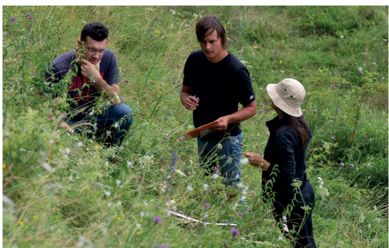
Figure 1d: Impressions from 12th Field workshop in the inner-alpine valleys, Switzerland. Slika 1d: Vtisi z 12. EDGG terenske delavnice v notranjih alpskih dolinah v Švici

Slika 1c: Vtisi z 11. EDGG terenske delavnice v vzhodnih Alpah v Avstriji.