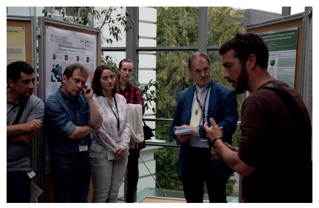
Figure 1b: Impressions from 16<sup>th</sup> Eurasian Grassland Conference in Graz, Austria. Slika 1b: Vtisi z 16. Evrazijske konference o traviščih v Gradcu v Avstriji.

The 11th EDGG Field Workshop was held in the Eastern Alps, Austria from 6th to 13th July 2018, with Martin Magnes, Philipp Kirschner and Helmut Mayrhofer as the local organizers (Magnes et al. 2018; Figure 1c). The field workshop was attended by 18 participants from 10 countries and 15 nested-plot series and 37 additional normal plots were sampled. The 12th Field Workshop also targeted the inner-alpine valleys but in Switzerland, organised by Jürgen Dengler and his co-workers (11-19 May, 2019; Dengler et al. 2019, Figure 1d). This field workshop was attended by 16 participants from 5 countries. During the field workshop, 30 nested-plot series and 81 additional normal plots were sampled. The 13th Field Workshop: "Grasslands of Armenia along an elevational gradient" was held between 26 June -7 July 2019 in Armenia, organised by Alla Aleksanyan. Further details will be included in the next report, as this field workshop was still in progress at the time of the submission of this manuscript.