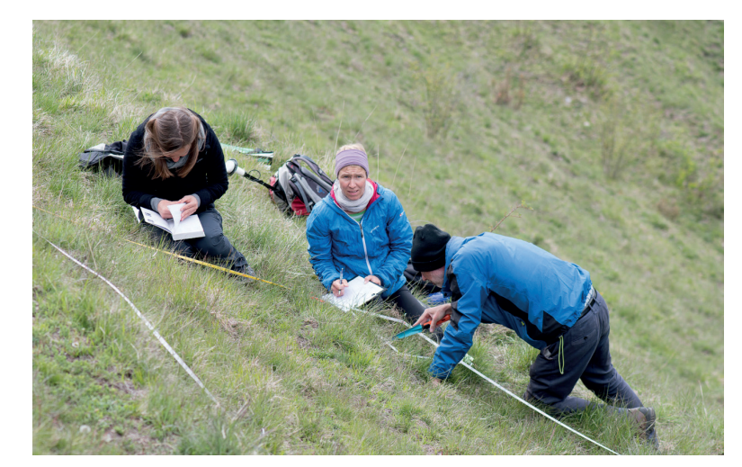
Figure 1c: Impressions from 11th EDGG Field Workshop in the Eastern Alps, Austria.

Slika 1c: Vtisi z 11. EDGG terenske delavnice v vzhodnih Alpah v Avstriji.