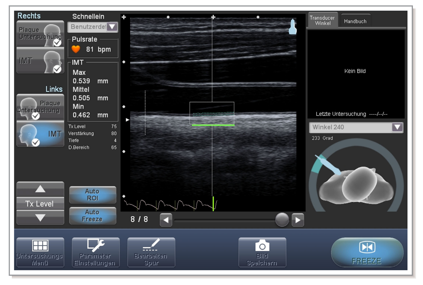
Figure 1. Visualization of the carotid intima-media thickness measurement.

Patients' data were compared with 191 healthy controls (111 women) of the same age range (36.7 \pm 13.5 years). All