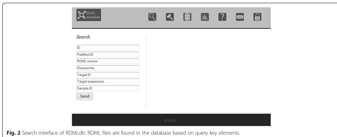
Fig. 2 Search interface of RDMLdb. RDML files are found in the database based on query key elements

Over the past five years, the universal qPCR data exchange file format RDML has been well accepted by the scientific user community and is implemented in many qPCR instruments available today. Further, being part of the MIQE guidelines, it is endorsed by scientific journals and publishers. Although this is a big achievement, the use of RDML should not stop at this point. Currently, we see the bottleneck at the level of handling RDML files and RDML file exchange. The editor, RDML-Ninja, has been designed with different user types in mind. In the laboratory, RDML-Ninja should allow researchers to enter information into RDML elements not supported by the software of their qPCR instrument. Furthermore, RDML-Ninja can form a bridge between software supporting different RDML versions by handling the