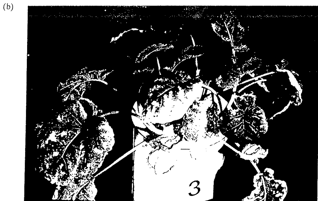
Fig. 2. (a) Symptoms of thallium toxicity in bush beans at 10 mg Tl/I nutrient solution (b) Symptoms of thallium toxicity in green rape at 20 mg Tl/I nutrient solution