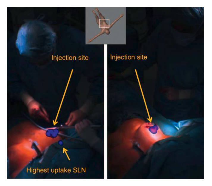
Fig. 1. Overlay picture of radioactivity data obtained with an intraoperative freehand single-photon emission computed tomography (SPECT) scan in projection on the live video of the patient showing the anatomic position of the axillary lymph node with the highest uptake (left). A second freehand SPECT scan was conducted after the surgical removal of the sentinel lymph node (SLN), which confirmed that there was no residual radioactive activity in the axilla (right).

The freehand SPECT technology was introduced by Wendler et al. in 2010 within a preoperative setup [6]. This report presents its initial evaluation in the operating room in an SLNB procedure for breast cancer.